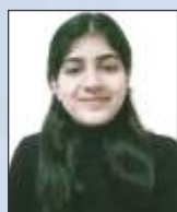
Kriti Ranjan Mirza International (RedTape) 2019-22